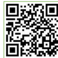
App Store – Apple

Download the mobile app by scanning the QR code or searching WellCar in the Apple App Store or Google Play Store.