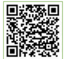
Play Store – Google